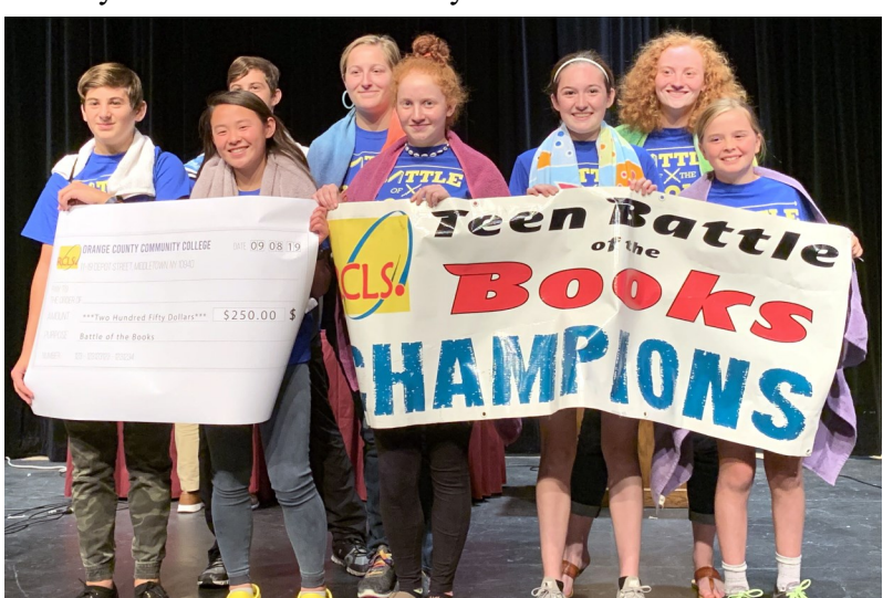
Moffat Library of Washingtonville 2019 Teen Battle of the Books winners

The next Battle of the Books committee meeting is scheduled for Monday, November 4 at 9:00 a.m. at the Suffern Library. New members are always welcome.