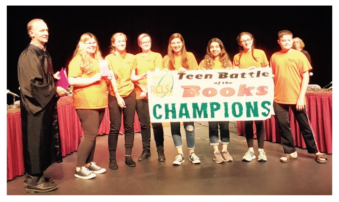
2017 Teen Battle of the Books winners from Daniel Pierce Library in Grahamsville.